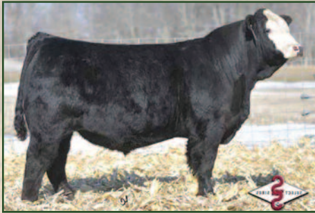
MR SR Highlife G1609