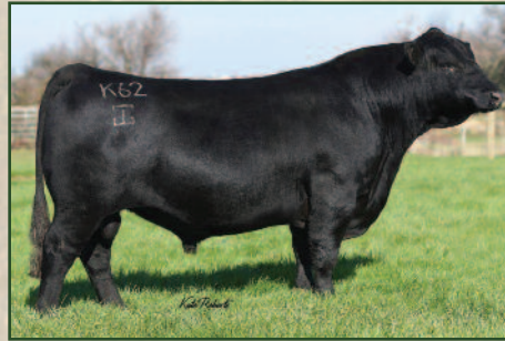
G A R Sure Fire K62