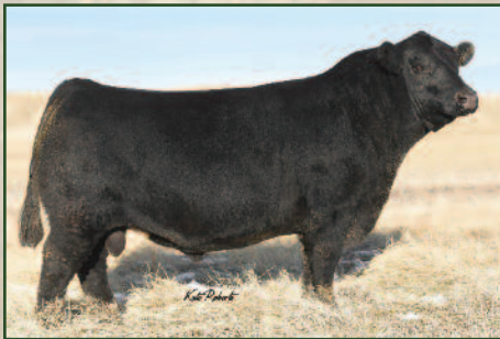
CCR Boulder 1339A