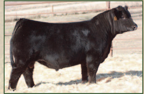
W/C Night Watch 84E