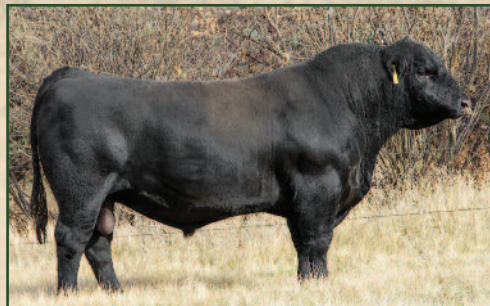
Gibbs 7382E Broad Range