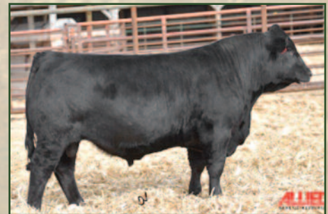
Hook's Beacon 56B