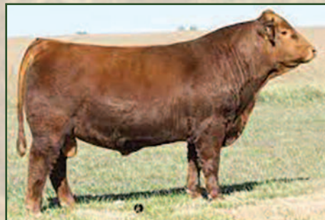
IR Imperial D948